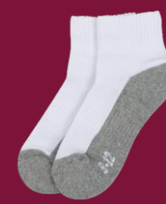
White crew sock