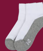
White crew sock